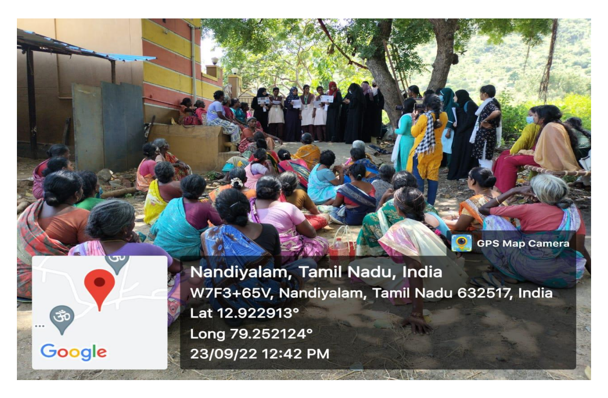
NUTRITION EDUCATION PROGRAMME FOR 100 DAY WORKERS AT NANDIYALAM